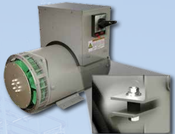
Vibration Isolated conduit boxes, gasketed for environmental protection.

Constructed for extended life by utilizing Marathon's exclusive unirotor construction, UL1446 Recognized Class H insulation system, and long life bearings. MAGNASELECT ™ designs are the ideal general purpose generators for your prime power markets as well as your emergency power needs.