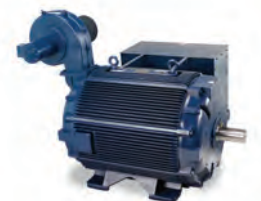
Dripproof Force Ventilated