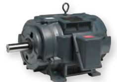
Oil Well Pumping