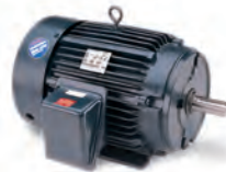
IEEE45 USCG Marine Duty